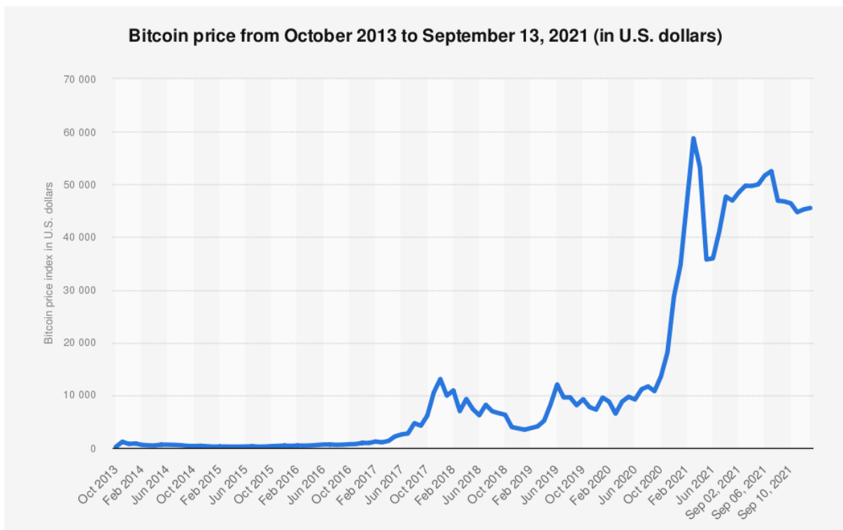
Figure 2 – Bitcoin price from October 2013 to September 13, 2021 (in U.S. dollars)

With potential global financial crises or recession there is an ongoing anxiety in financial realms of society, and more and more people are seeking new paths to secondary income, hedging options and revenue generating investments. Just like stock market, cryptocurrency market is characterized by similar events such as Crashes, Crises and Bubbles. The most basic way to describe a bubble is a price in upward direction that tends to implode after extended period of time of growing. Majority of investors in the case of bubble are