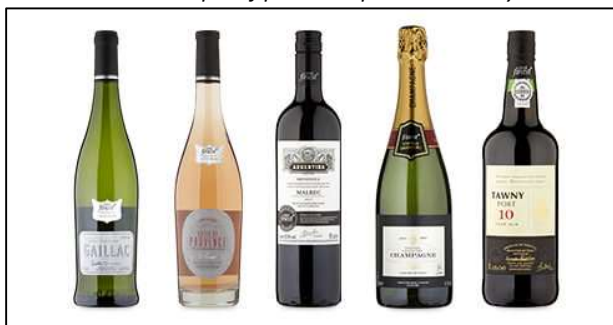
Picture 4. Example of premium private label by Tesco

Walmart, the world's largest company by revenue, among all the private labels it owns, offers "Sam's Choice" products, their premium tier brand. Another example is Tesco's Tesco Finest, that specializes in the finest wines, meats, fresh produce, desserts, etc. Such as I mentioned before, regarding advertising, the pricing of the product is never mentioned, but a great focus on the quality is made. When we take a look at Tesco Finest's wines (Picture 4), they are promoted in the following way on their website: "Explore the world's most renowned vineyards, distilleries and breweries with our exceptional Tesco Finest range, which includes several award-winning wines" (Tesco, 2022).