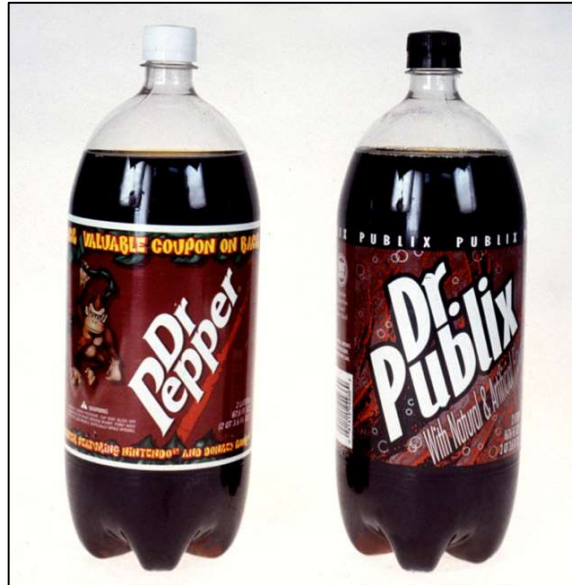
Picture 2. Example of copycat brands in soda