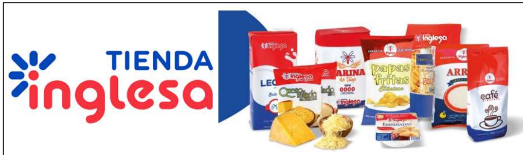
Picture 8. Tienda Inglesa's logo and the packaging of its private label

It does not look like the brand leader. We try to identify the goods with our logo, with our colors (red, white and blue). The main objective is to differentiate from our competitors by using our colors and brands (Picture 8).