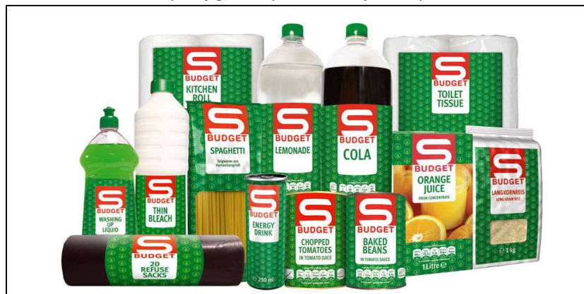
Picture 3. Example of generic private label from supermarket SPAR

The arrangement between retailer and manufacturer does not involve much product development, just a contract for the production of goods with lagging technology. The target audience for generic private labels is customers with a low price option and these brands try to expand their customer base. They tend to be placed in less visible shelves or in a position where people have to make an effort to find them. Besides, the brand name is not normally included (for example, Spar generic products are labelled as S-Budget (Picture 3) and Konzum products are named K-Plus).